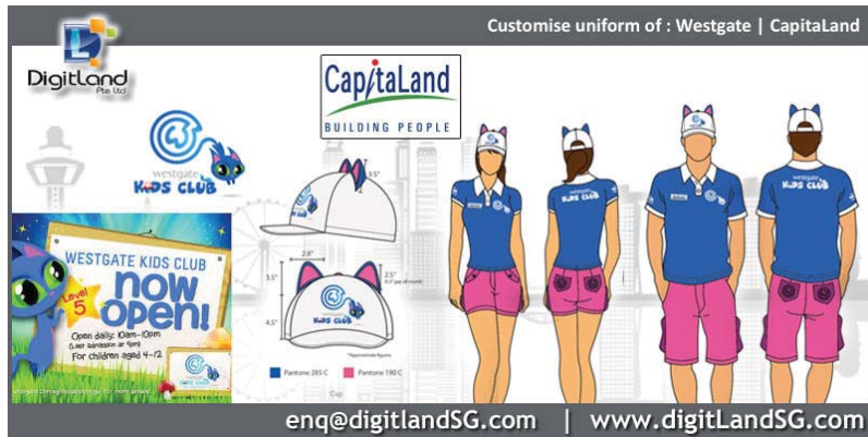
Supply Customise uniform of special design' Cap with Cat-ear attached - for : WestGate Kids Club: with Embroidery logo