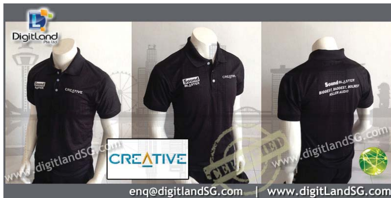
Supply customise corporate POLO with printing for: CREATIVE: product show