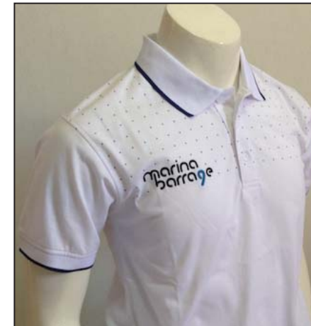
Supply customise staff uniform for: Marina Barrage counter staff