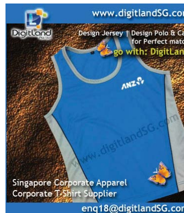
Supply customise running singlet for ANZ