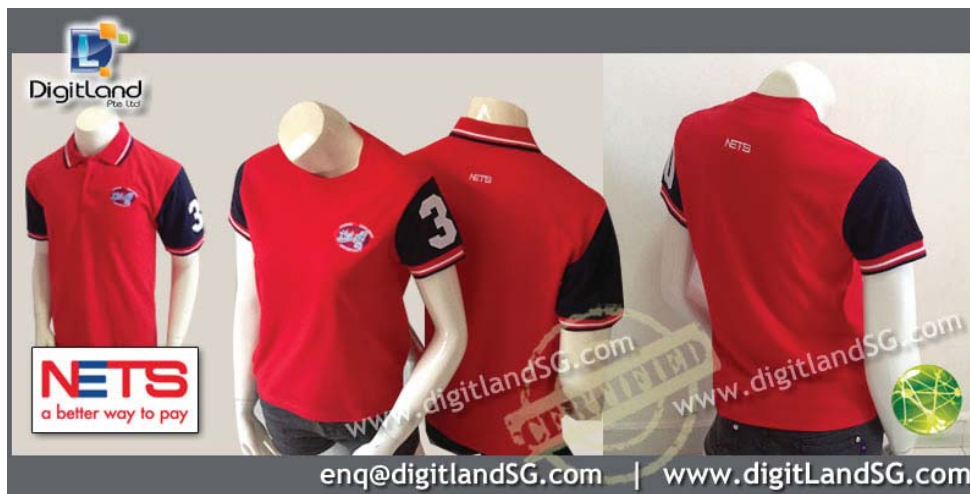
Supply Customise design of Company POLO for staff members (Men & Lady) of: NETS - Singapore with Logo Embroidery and POLO style with sleeve in Number Embroidery patch