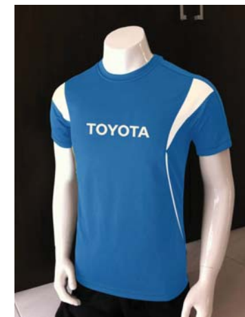
Supply customise running jersey for TOYOTA asia Singapore