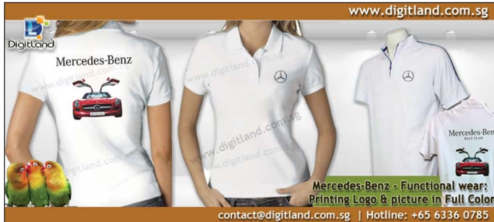
Supply Promotional POLO in corporate style for: Mercedes-Benz with Printing in smooth Gradient contrast of Product Photo