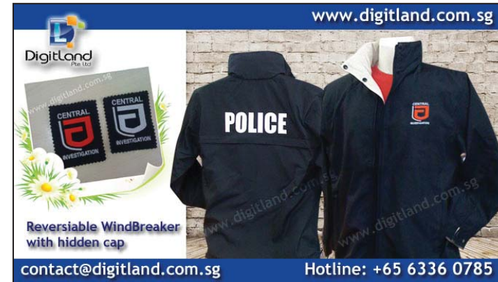
Central Police Investigation - Corporate Reversible Jacket supply with printing and Logo Embroidery