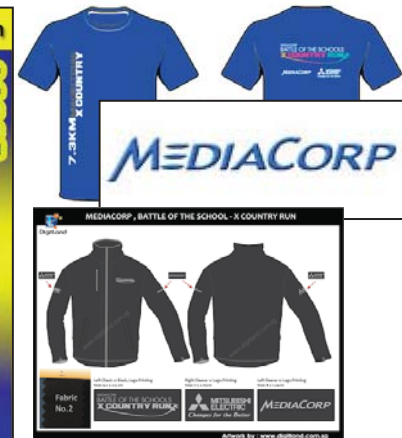
Print & Supply merchandise for: X-country-Run events Finisher Jacket Runner Tee | Volunteer Tee Staff / Officer Tee Goodies Bag